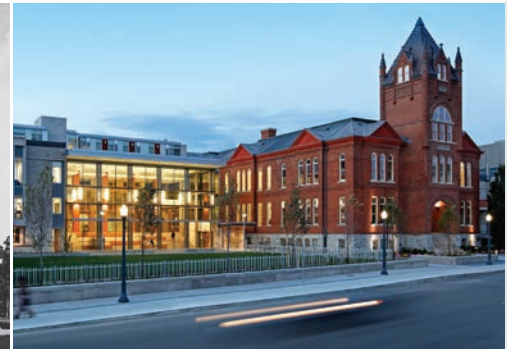
Goodes Hall today