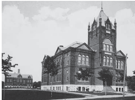
Goodes Hall circa 1920

September 2012 marked the completion of a significant expansion of Goodes Hall, that includes several new state-of-the-art classrooms, student breakout rooms and many enhanced features for our students.